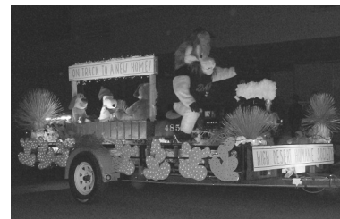
2011 Christmas Float "On Track to a New Home"